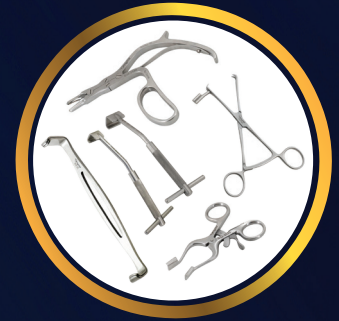
Small Bone Instruments