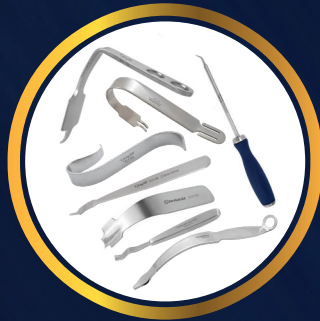
Knee Surgery Instruments