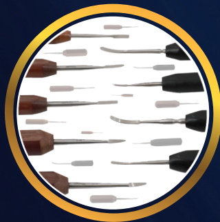
Surgical Elevators Phenolic Handle