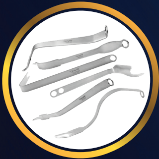
Hip Surgery Instruments