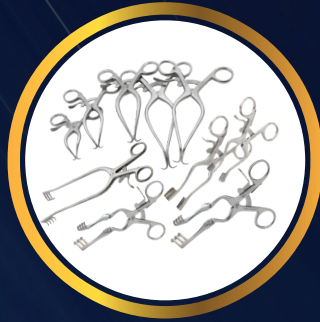
Gelpi & Weitlaner Retractors