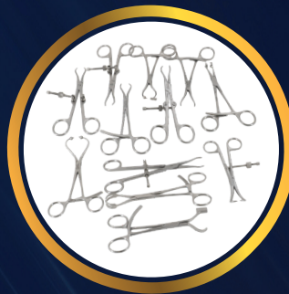
Bone Holding Clamps